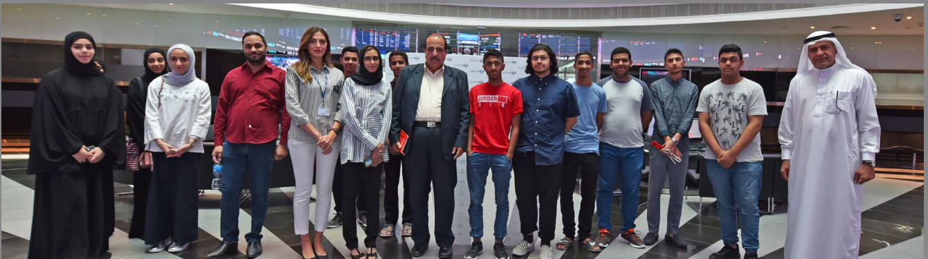
National Society for the Support of Education & Training Delegation