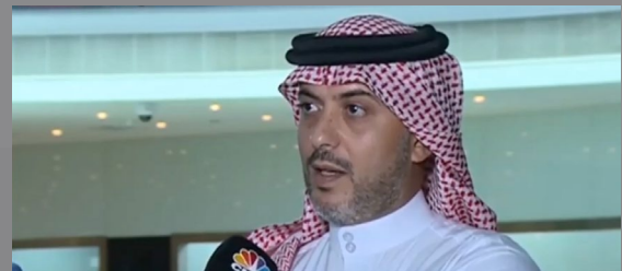
CEO of Bahrain Bourse Interview on Bahrain Trade Platform