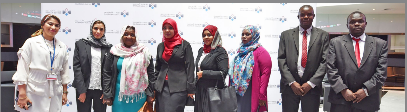
Khartoum Stock Exchange Delegation