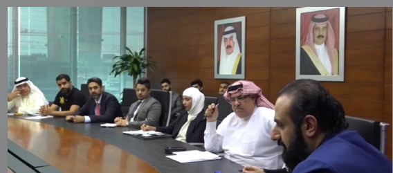
The Periodical Consultative Meeting with the Licensed Brokers in Bahrain Bourse