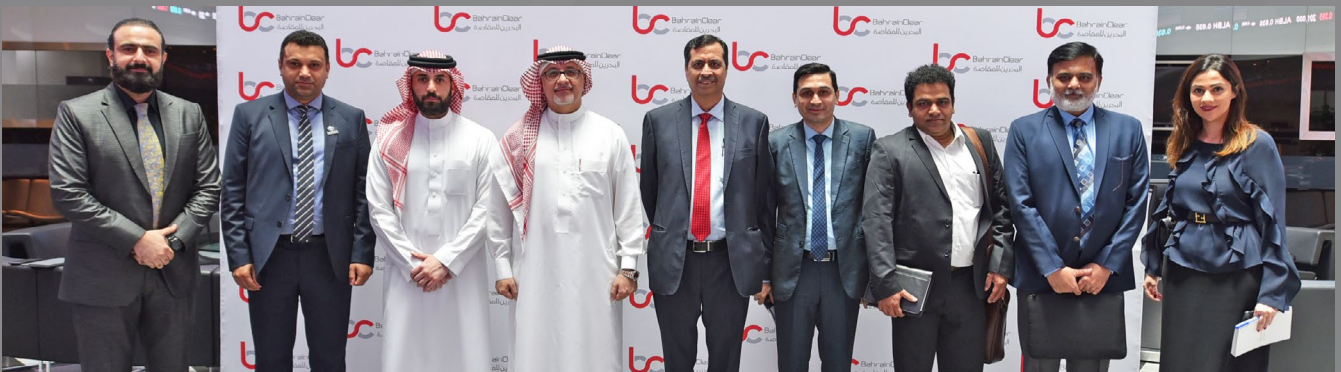
National Securities Depository Limited (NSDL) Delegation Visit to Bahrain Clear