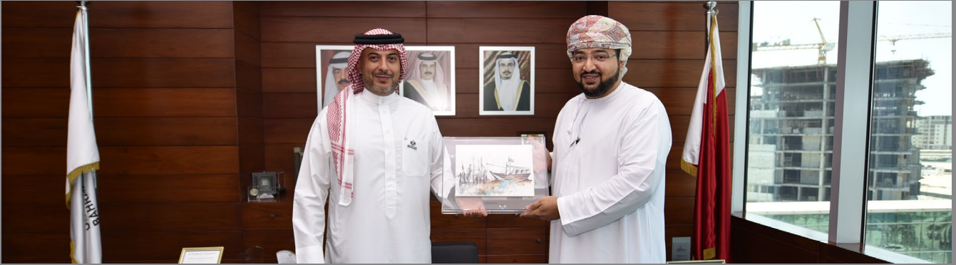
Muscat Clearing & Depository Delegation